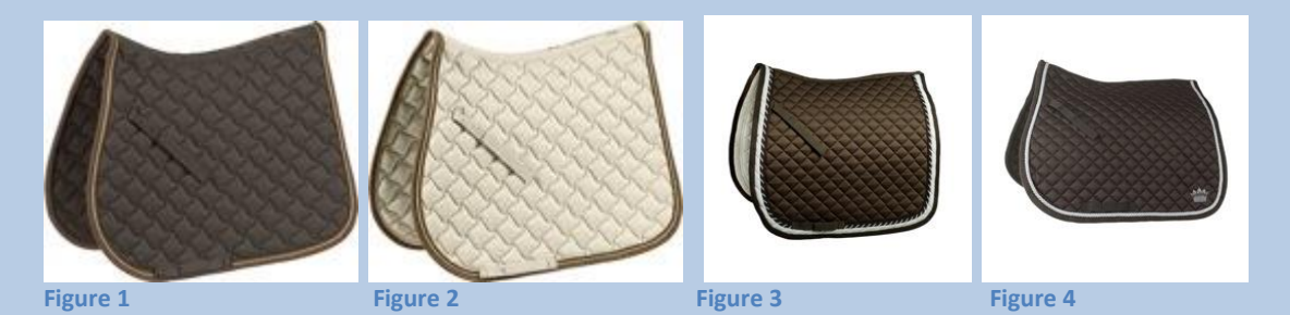
Figure 1 – High protection saddle pad in chocolate, light brown binding, light brown/golden colour braids in Dressage or AP, about $79 TBC

Erika from Horse in the Box has sent us details about saddle blankets and other items for our uniform.